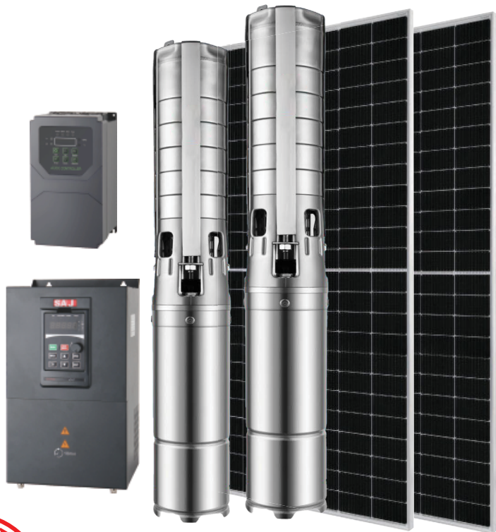
Solar Panels Sold Separately